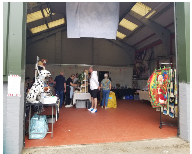
Browsing the market stalls at Ballinglach Industrial Estate at the July summer fair hosted by SIRTN Toys

Mathers Dairy Utensils, who lease the front two units, have been busy working on local farms over the past few months. They are also looking forward to setting up and stocking the retail space at the Industrial Estate in due course and announcing a grand opening to the public, so please keep an eye on our Facebook page for further updates.