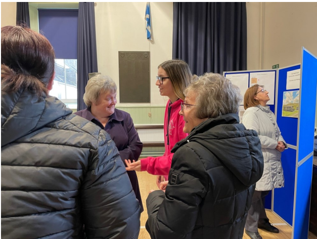
Dunragit community consultation attendees