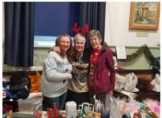
The spirit of Christmas at Glenluce Public Hall

A connection point is being factored into the new Dunragit Community Hub for additional Christmas lights this year.