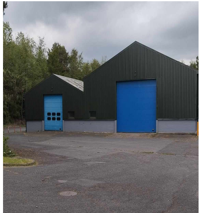
The newly refurbished Ballinlach Industrial Estate

We are still following up on expressions of interest for tenants for the rear Units 1 and 4, so please let us know if you are an active local business that would be interested.