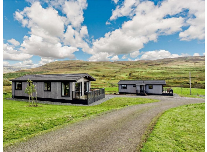
Example of the cabin proposed for the Hub