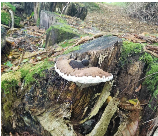
Autumn colours and vibrant growth in The Glen