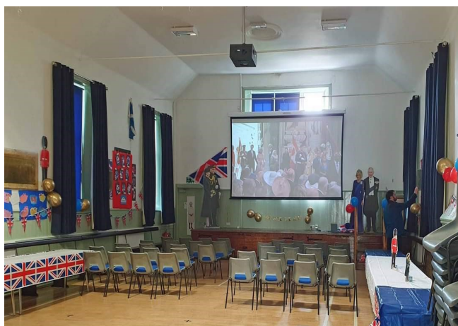
The Hall is ideal for all types of activities and events

Forestry & Land Scotland hosted a public consultation drop-in session in July, where local residents had their say around the proposed Land Management Plan for Torrs Warren and the wider Dunragit area.