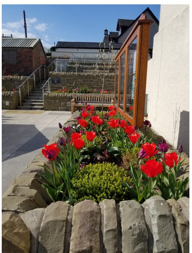
A kaleidoscope of colour in the Village Square