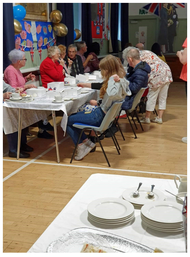
Enjoying a delicious afternoon tea at the Old Luce Community Council celebrations for King Charles III's coronation in Glenluce Public Hall