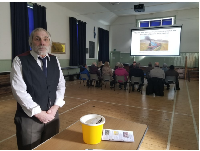
Old Port Road ('Paddy') Line Presentation

Hall running costs funded by Carscreugh Energy Ltd, through the Old Luce Community Fund