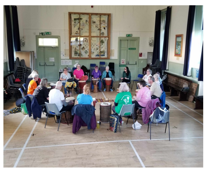
Making music with hosts Stranraer Drum for Fun at a recent taster session in Glenluce Public Hall