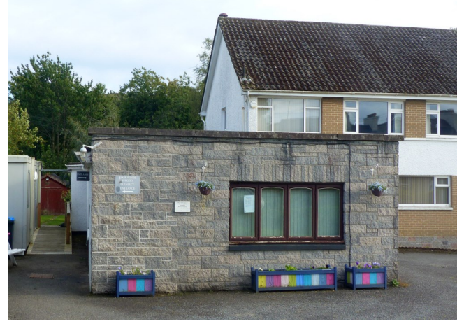
Four Winds GP Surgery

The Trust is continuing to work closely with the GP Practice Management Team and Dumfries & Galloway NHS to finalise the required size and design of the new Surgery building and discuss funding options. We are currently waiting on the final outcome of the NHS consultancy process before progressing any further.