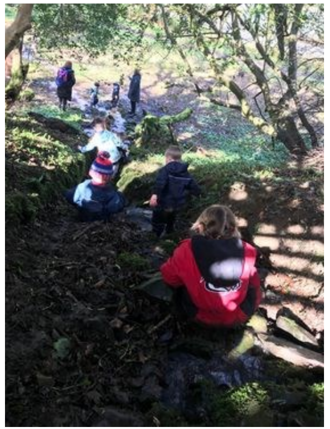
Glenluce Primary School teachers and students learning about nature in the Glen

Remember, if you are taking a wander through our lovely community woodland, please take home and bin what you bring.