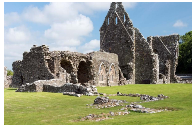
Glenluce Abbey—Historic Environment Scotland

We're delighted to hear that one of our iconic local historic visitor sites Glenluce Abbey is set to re-open in the coming months after high level masonry inspections were conducted as a safety precaution across many sites in the country over the past year by Historic Environment Scotland. If you're planning some walks in our beautiful area this spring and summer such as the Whithorn Way, Glenluce Abbey is a definite must to visit along the way.