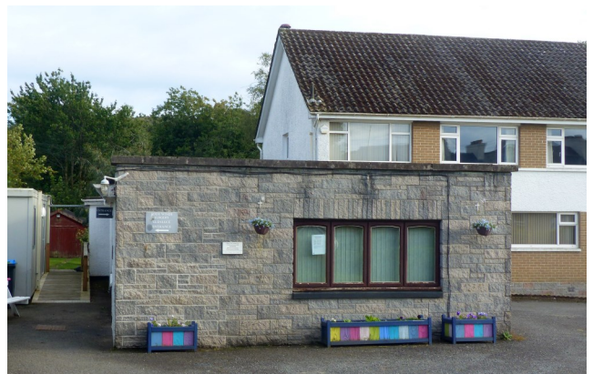
Four Winds GP Surgery

The Trust also engaged Community Enterprise to conduct research into potential funding opportunities for the remaining funding for the Glenluce Healthy Living Campus development, whilst also continuing its own discussions with funders, and will take forward the recommendations over the coming year.